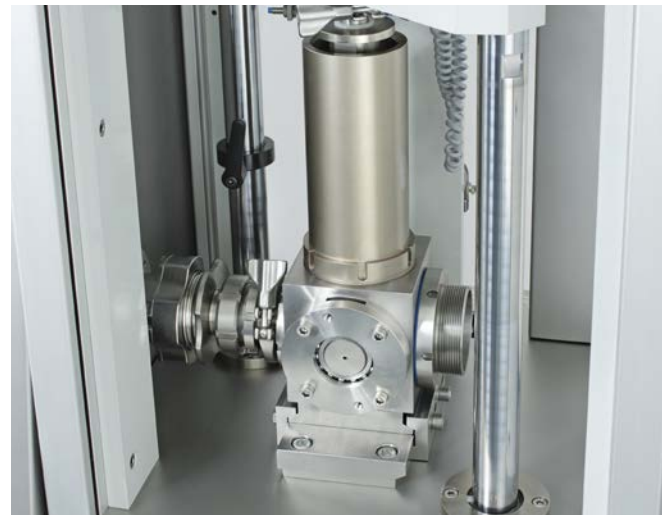
Volumetric dosing of HDP – high accuracy of filling quantity

ensures trouble-free production and if required a no-worry product warranty. Poly-clip System is the world's leading provider of clip system solutions.