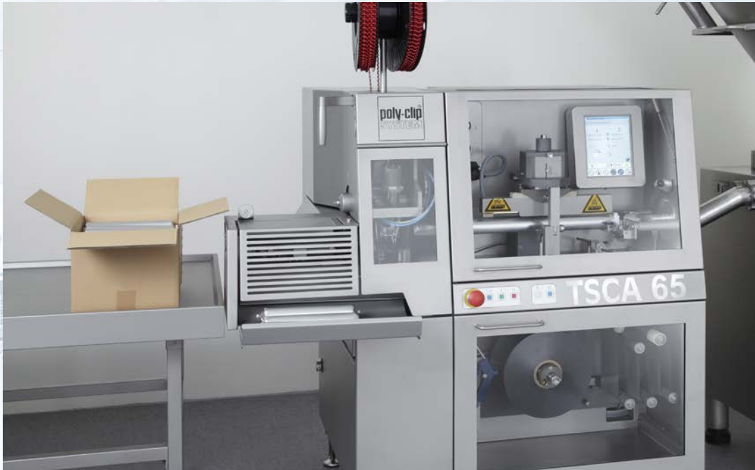
Efficient packaging of e.g. adhesives, sealants using the TSCA 65 D