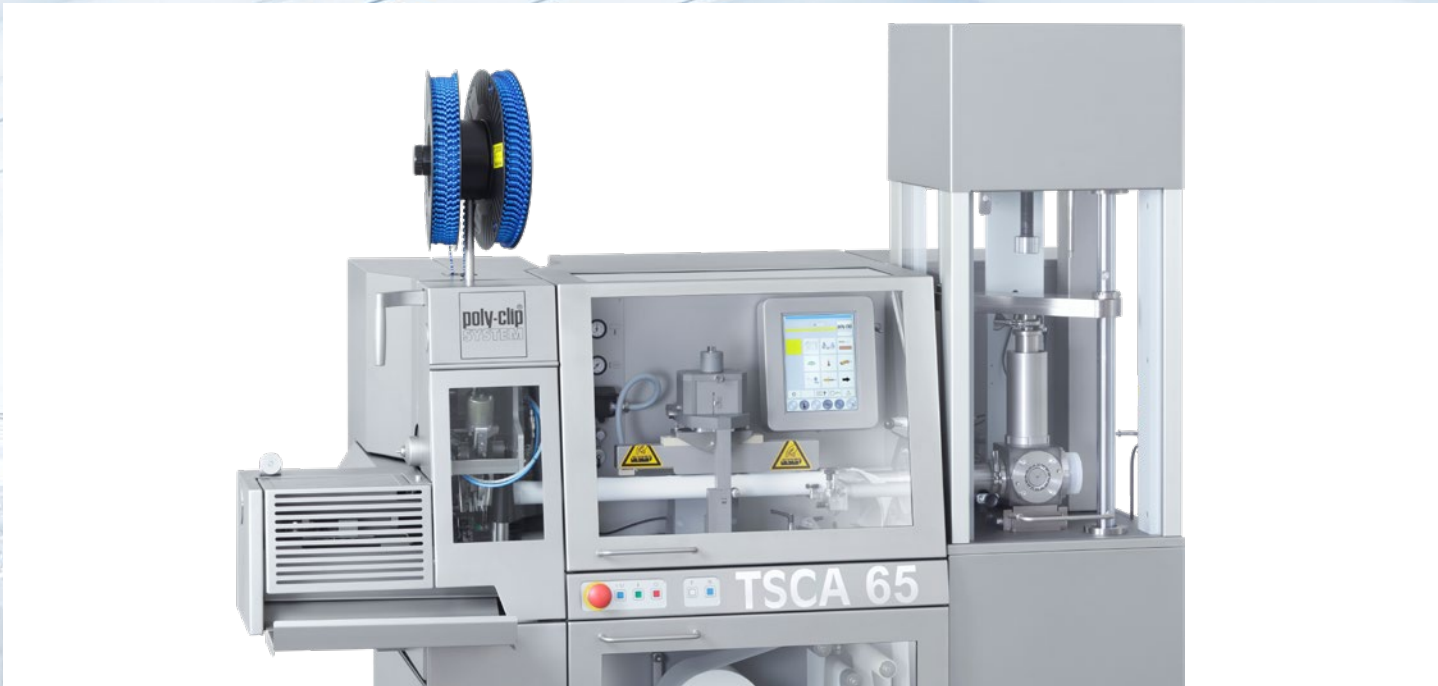
TSCA 65 D with HDP 40 (Hydraulic Dosing Pump) used for sealants and adhesives up to 65 mm diameter

ning roll carrier. Uniform inlet tension of the film is achieved by the roller guide system. The forming shoulder forms the flat film around the stuffing horn into an open tube. The tube is then sealed lengthways with minimal overlap by heat sealing. To prevent a runback of the product, the end of the stuffing horn is sealed by an inner calibre ring towards the tube so that even liquid products are filled to a precise preset weight.