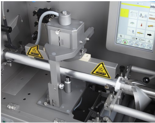
The TSCA 65 D heat-sealing station