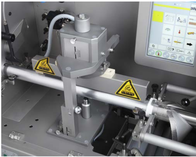
The TSCA 65 D heat-sealing station