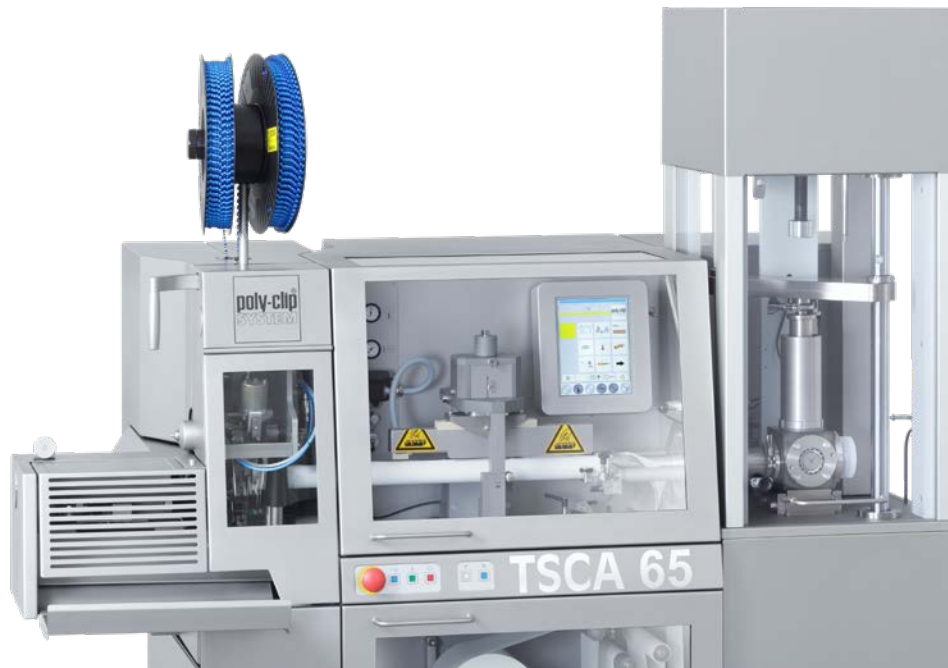
TSCA 65 D with HDP 40 (Hydraulic Dosing Pump) used for sealants and adhesives up to 65 mm diameter

The film roll is placed on a self-tensioning roll carrier. Uniform inlet tension of the film is achieved by the roller guide system. The forming shoulder forms the flat film around the stuffing horn into an open tube. The tube is then sealed lengthways with minimal overlap by heat sealing. To prevent a runback of the product, the end of the stuffing horn is sealed by an inner calibre ring towards the tube so that even liquid products are filled to a precise preset weight.