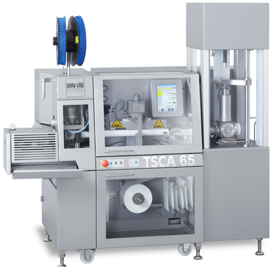
TSCA 65 D with HDP 40 (Hydraulic Dosing Pump) used for sealants and adhesives up to 65 mm diameter

The complete system of clipping machine, clips and loops from a single source ensures efficient and trouble-free production. Original clips from Poly-clip System guarantee the highest quality. Manufacturing is subject to the most rigorous quality controls. Certified in accordance with ISO 22000 and ISO 9001 they are designed to suit the production process perfectly. With its food-proof safety coating certified by the SGS INSTITUT FRESENIUS, Poly-clip SAFE-COAT technology ensures trouble-free production and if required a no-worry product warranty. Poly-clip System is the world's leading provider of clip system solutions.