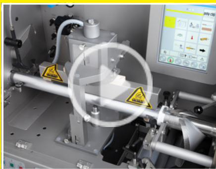
The TSCA 65 D heat-sealing station