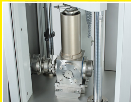
Volumetric dosing of HDP – high accuracy of filling quantity