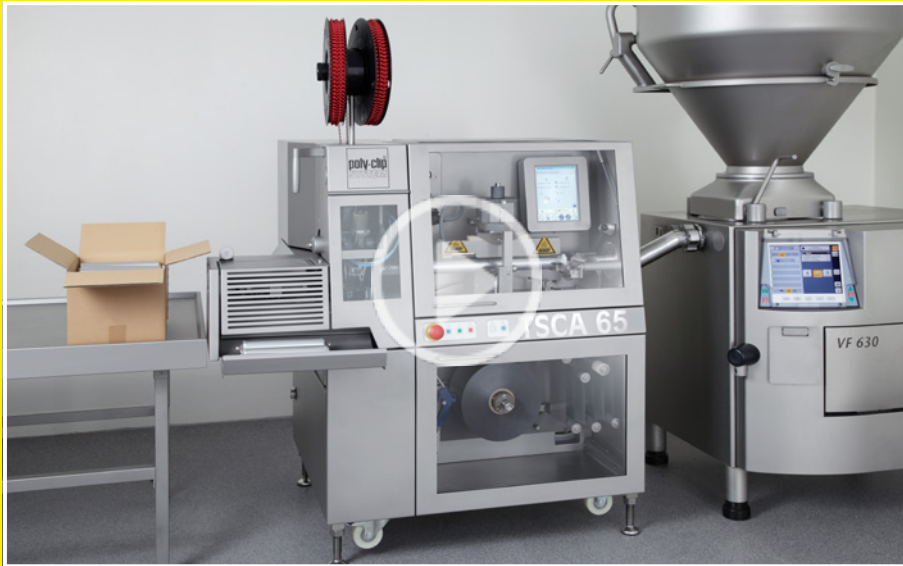
Efficient packaging of e.g. adhesives, sealants and explosives using the TSCA 65 D