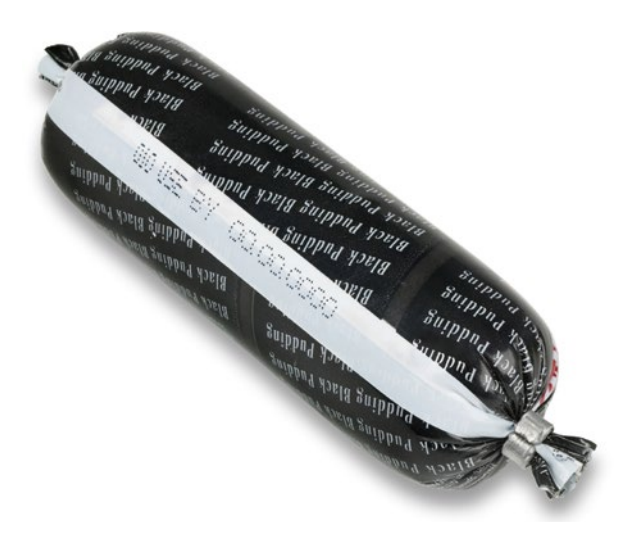
Product marking by printing directly onto the film

quality controls. Certified in accordance with ISO 22000 and ISO 9001 they are designed to suit the production process perfectly. With its food-proof safety coating certified by the SGS INSTITUT FRESENIUS, Poly-clip SAFE-COAT technology ensures trouble-free production and if required a no-worry product warranty. Poly-clip System is the world's leading provider of clip system solutions.