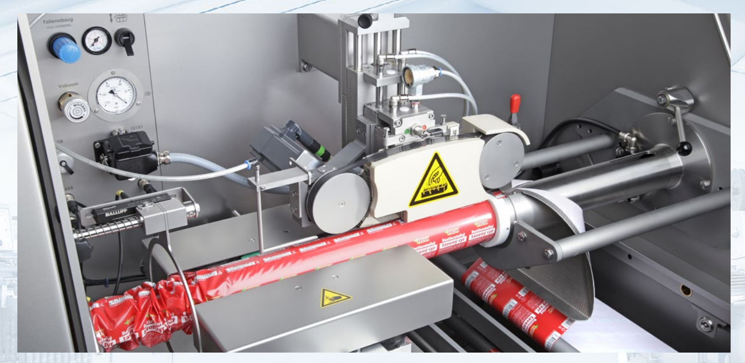
The hot-sealing station of the TSCA provides reliable sealing.