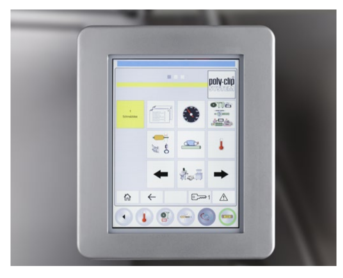
The TSCA SAFETY TOUCH panel: simple and clearly laid out