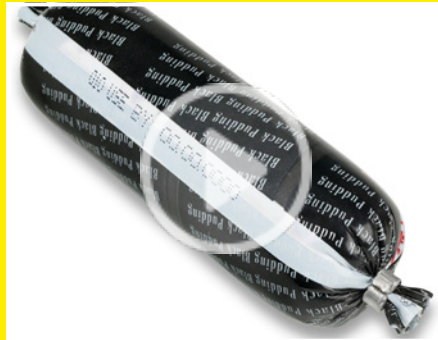
Product marking by printing directly onto the film