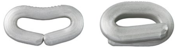
W-shaped "butt to butt" closures for natural casings, V-shaped "wrap around" closures for plastic and natural casings

The clipping machine SCH is operated manually. It is easy to handle with minimal physical effort. The casing is gathered by a hand lever before the clip is applied. Excess casing or bag ends can be trimmed with the integrated cut-off knife.