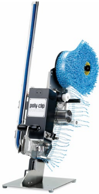
Version with pneumatic cutter and GSE (automatic loop)

The single-clip machines are operated pneumatically. The closing of the gate gathers the casing before the clip is applied automatically. With the SCD machine the clip pressure can be adjusted via a click-stop scale individually and reproducibly. In addition, product specific closing speed and pressure can be set with the pressure regulator assembly.