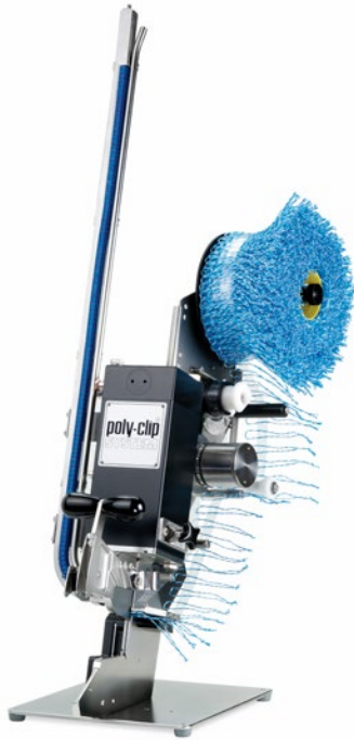
Version with pneumatic cutter and GSE (automatic looper)

The single-clip machines are operated pneumatically. The closing of the gate gathers the casing before the clip is applied automatically. With the SCD machine the clip pressure can be adjusted via a click-stop scale individually and reproducibly. In addition, product specific closing speed and pressure can be set with the pressure regulator assembly.