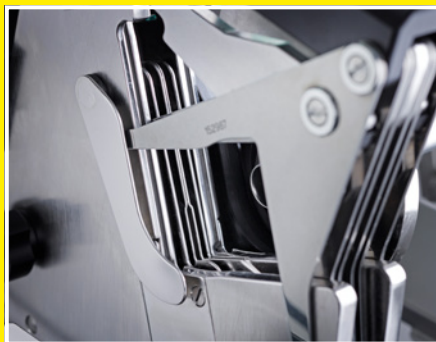
Separator adjustable individually to product calibre – for higher cycle times