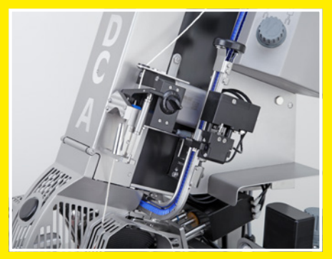
Electrical string dispenser