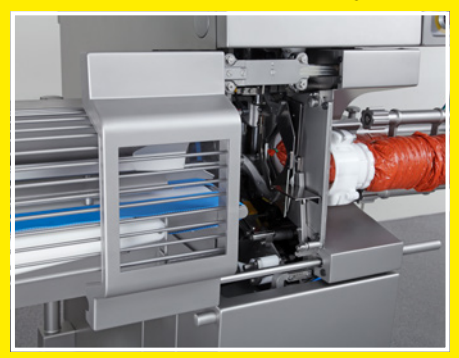
Shortest setup time due to comfort opening of front flap