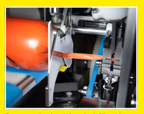
Overspreading for air-free slack filling of moulded products