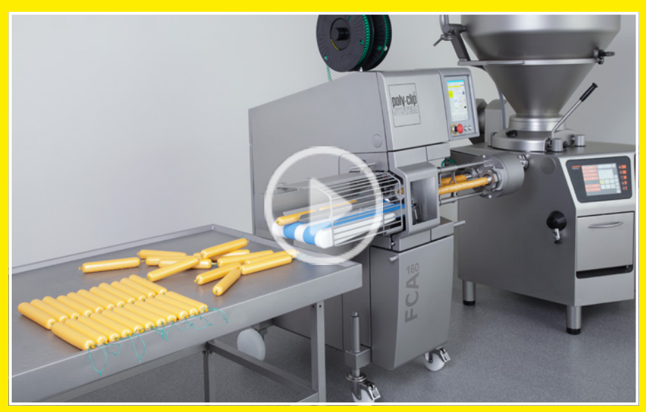
FCA 160 - powerful machine for large calibres