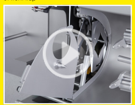
Separator cleaning flap