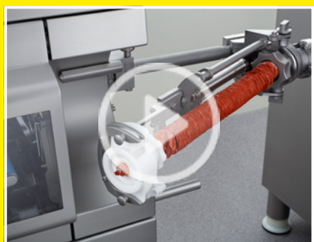
Casing brake assistant - semi-automatic casing brake holder system