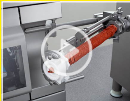
Casing brake assistant – semi-automatic casing brake holder system