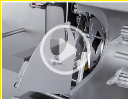
Separator cleaning flap