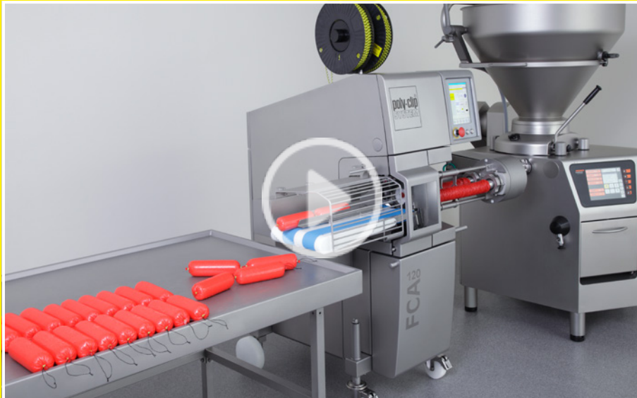
FCA 120 – the specialist machine for high speed production of calibres up to 120 mm