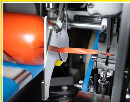
Overspreading for air-free slack filling of moulded products