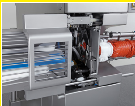
Shortest setup time due to comfort opening of front flap