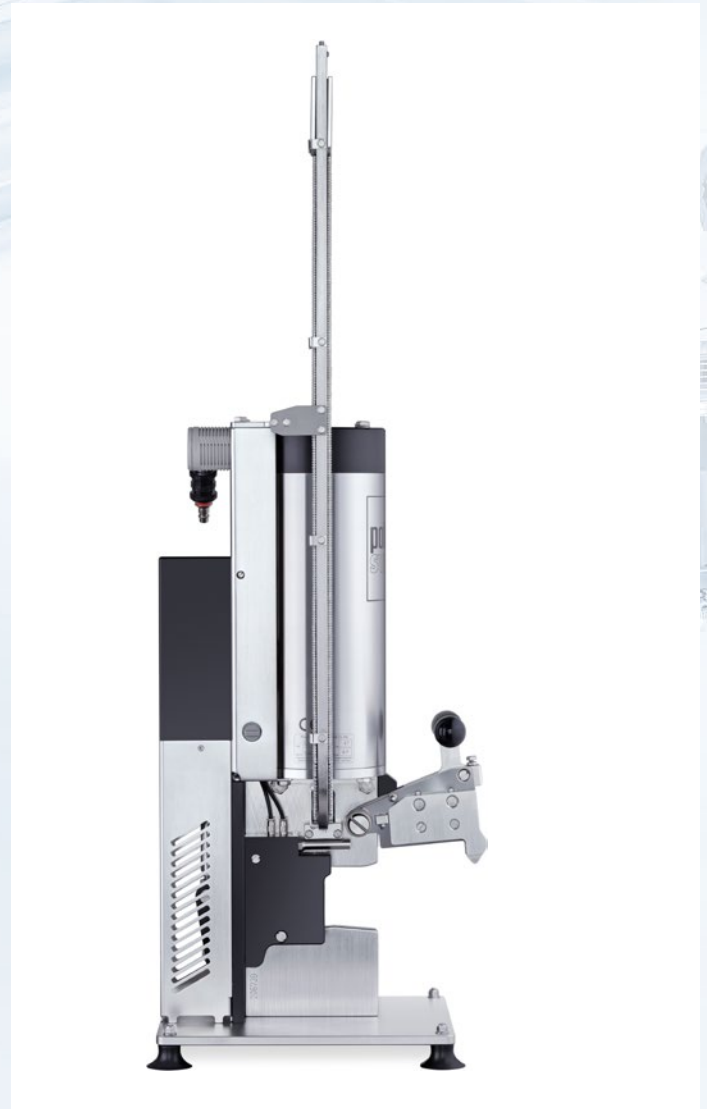
EZ 8080 with optional knife

Dimensions, weight and consumption values vary depending on the equipment and/or machine configuration.