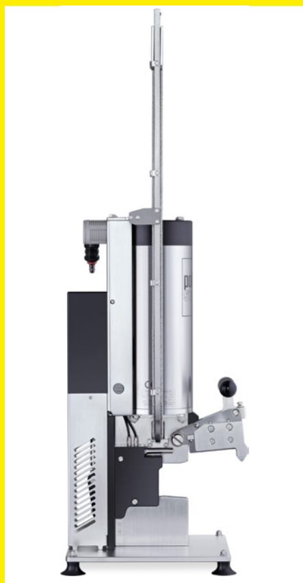
EZ 8080 with optional knife